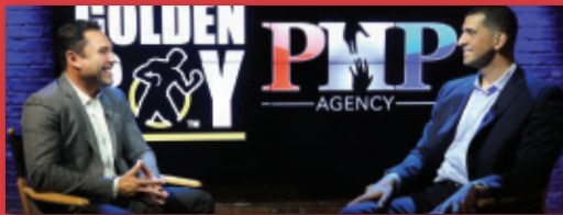
OSCAR DE LA HOYA